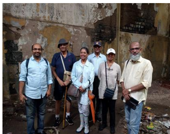
Site visit to Hydraulic Engine House