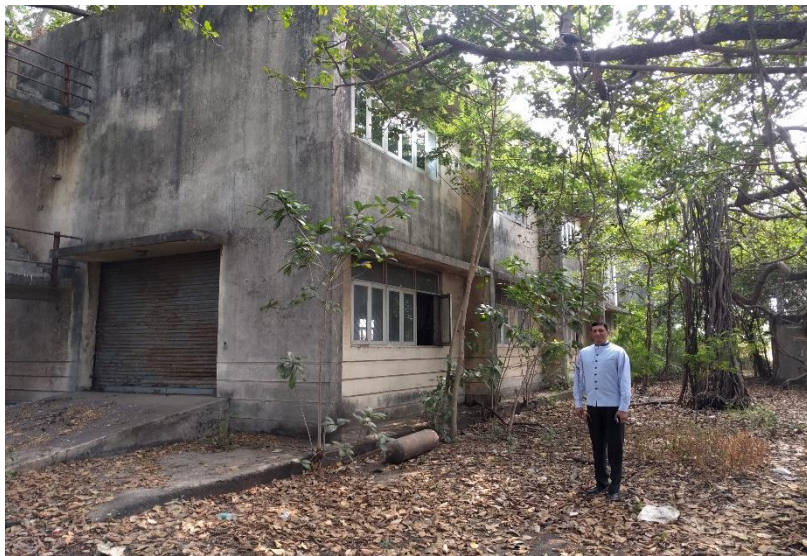
Merewether Dock Building

However, many members of MMMS continue to harbour the aspiration that the Ghadiyal Ghar, a heritage structure built in 1888, would be the ideal building for a Maritime Museum. This may be ambitious, but time will tell which option will fructify, with persistence and determination of MMMS.