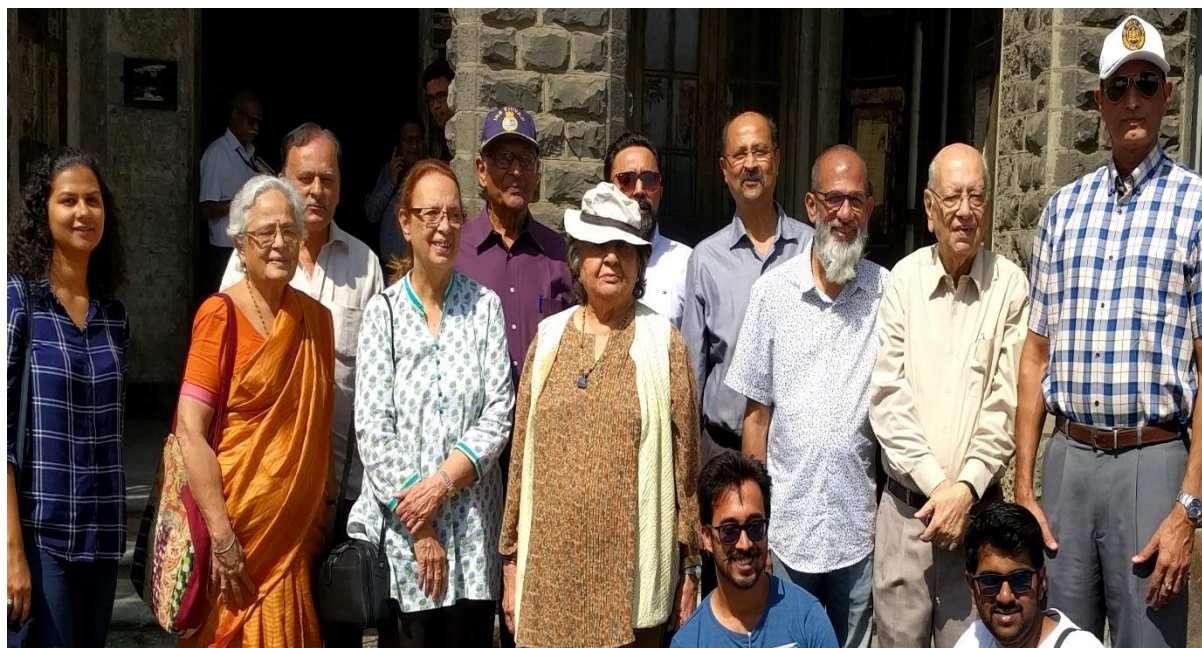
Site visit to Ghadiyal Ghar