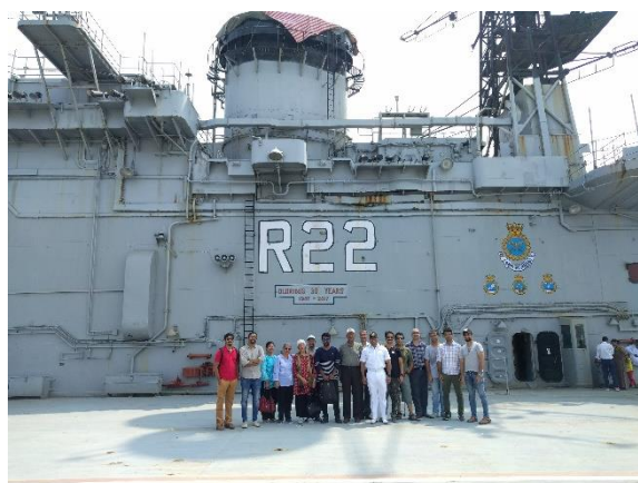
Site visit to Viraat